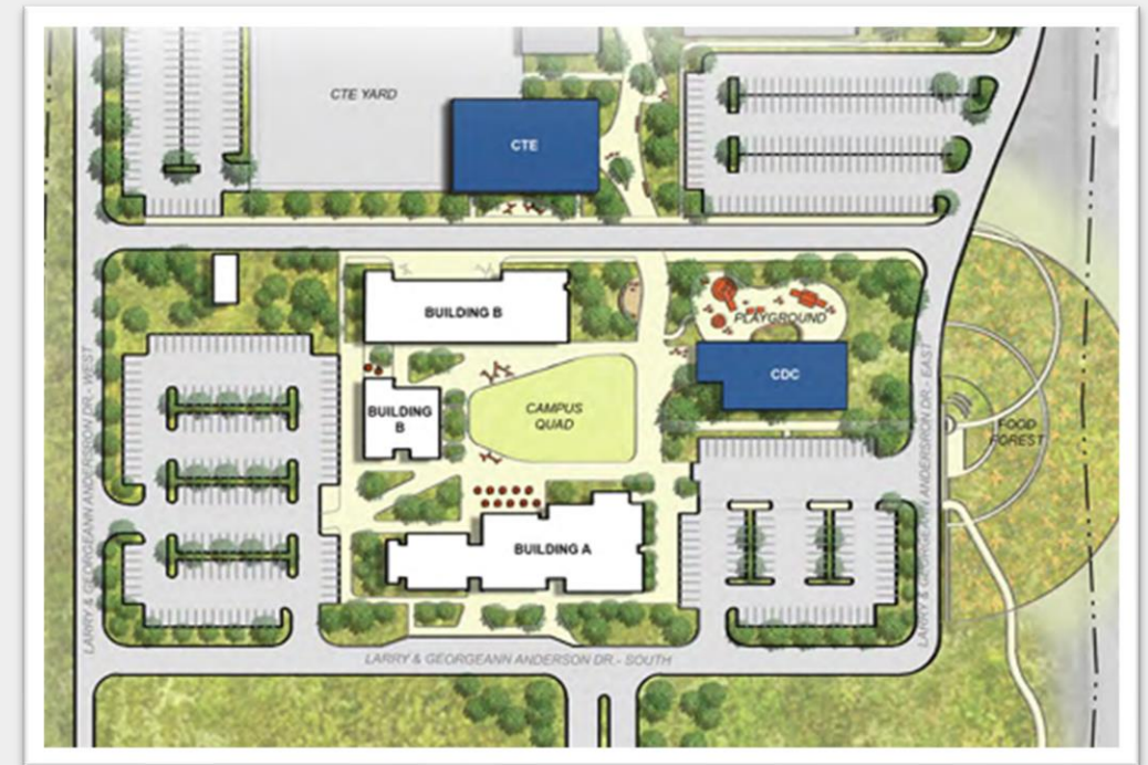
2019 Facilities Master Plan