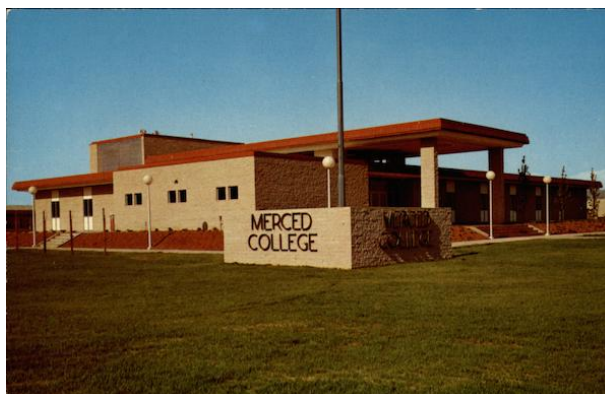
Merced College Administration Building in 1978

form a new county. When the petition was granted, Governor John Bigelow formed Merced County on April 19, 1855. According to the 1857 tax assessment rolls, the new county hosted a population of 277 with the first county seat located in Snelling. Once the railroad came through the county, much of the business and the county seat moved to the new town of Merced, which was incorporated in 1889. Since that day, growth and change has continued in Merced County.