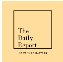
Labor Rep News