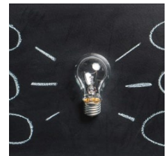
Training & Education