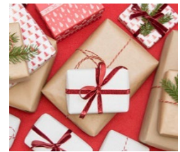
Featured Holiday Benefits