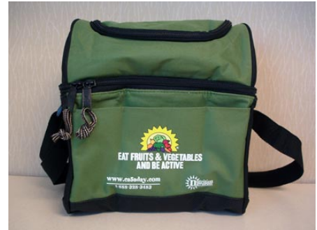
Lunch box pictured tested positive for lead

In a news release from the California Department of Public Health (CDPH), consumers are urged to stop using lunch boxes, which have been distributed as CDPH nutrition educational items, after testing showed elevated levels of lead in three lunch boxes. The canvas lunch boxes that showed elevated levels of lead were green with a logo reading EAT FRUITS & VEGETABLES AND BE ACTIVE. Approximately 56,000 of these lunch boxes have been distributed throughout California at health fairs and other events. Individuals who have these lunch boxes should return them to the place where they got them, if possible, or take them to their local household hazardous waste (HHW) collection facility for disposal. Local HHW facilities can be found at one of the following Web sites: