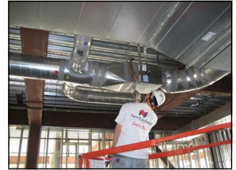
NW Corner of Bldg. (Hollow Metal Framing)