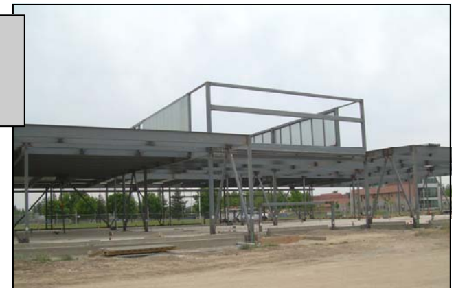
North side of East Building