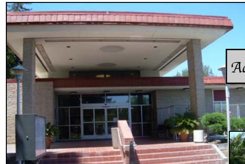
Administration Building Remodel

The Administration Building Remodel (ABR) and the Student Union Remodel (SUR) will provide expanded learning opportunities for the students and staff of Merced College and the Merced Community. The ABR Project consists of various site improvements for access compliance, restroom upgrades, various interior access improvements, renovations and relocations, including a new Board Room. The SUR Project consists of various site improvements for access compliance, restroom upgrades, renovations of several areas of the Buildings to accommodate Faculty adjustments and relocations. The ABR Project is scheduled to be completed December of 2008. The SUR Project is scheduled to be completed Spring of 2009.