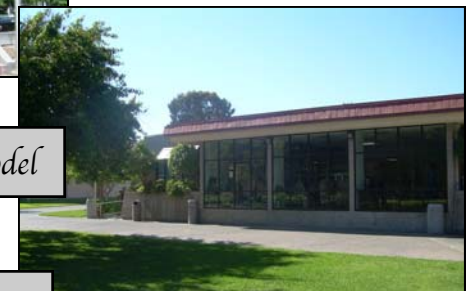
Student Union Remodel