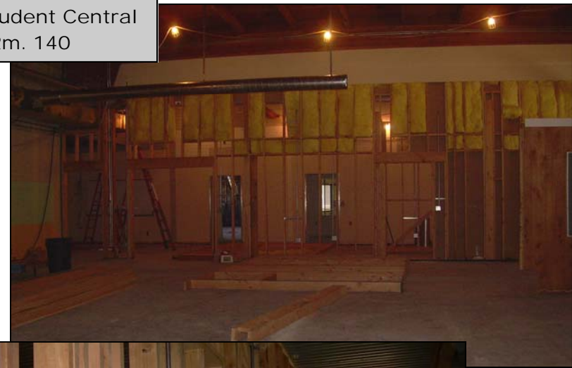
SUR: Student Central Rm. 140